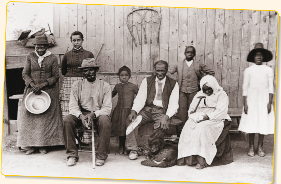
Among the many people who helped slaves to freedom was former slave Harriet Tubman (far left). She became a well-known guide on the Underground Railroad. She is pictured with her husband (third from left), along with other formerly enslaved people.

8.9.1 Describe the leaders of the movement (e.g., John Quincy Adams and his proposed constitutional amendment, John Brown and the armed resistance, Harriet Tubman and the Underground Railroad, Benjamin Franklin, Theodore Weld, William Lloyd Garrison, Frederick Douglass).